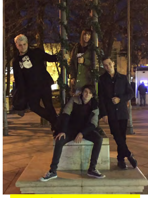
THE ADAMIĆ SCHOOL BANDMEMBERS