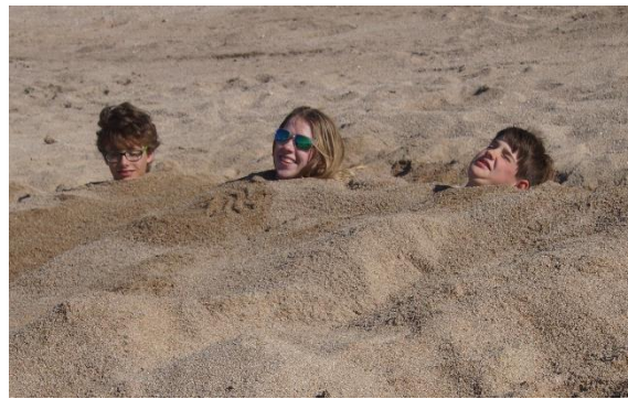
My friends and me on the holidays