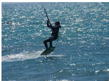
Me at kitesurfing

I spend a lot of time at the sea camping with my family and some friends because of my unusual hobby. We often drive to the sea at the weekends just for a few hours of kiting. It's the best way to get away from all the school-stress ;)