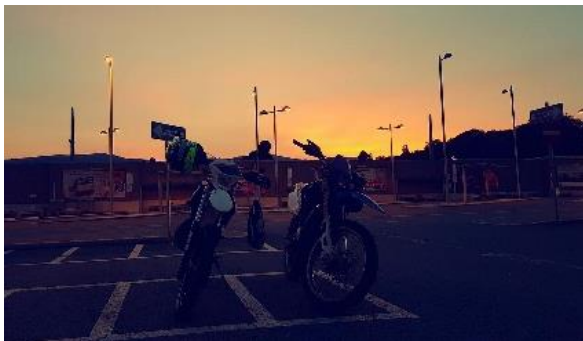
My friend's and my bike

In my free-time I like to meet my friends, listen to music ride my motocross and to kitesurf (as you see on the picture below). I also like to spend time with my rabbits in the nature and playing Badminton with my friends.