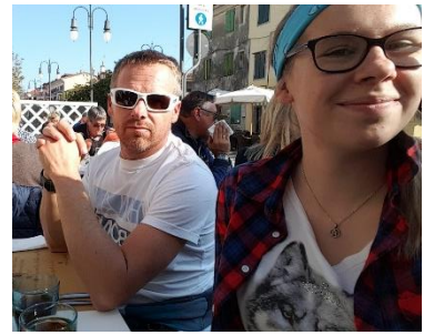
My dad and me